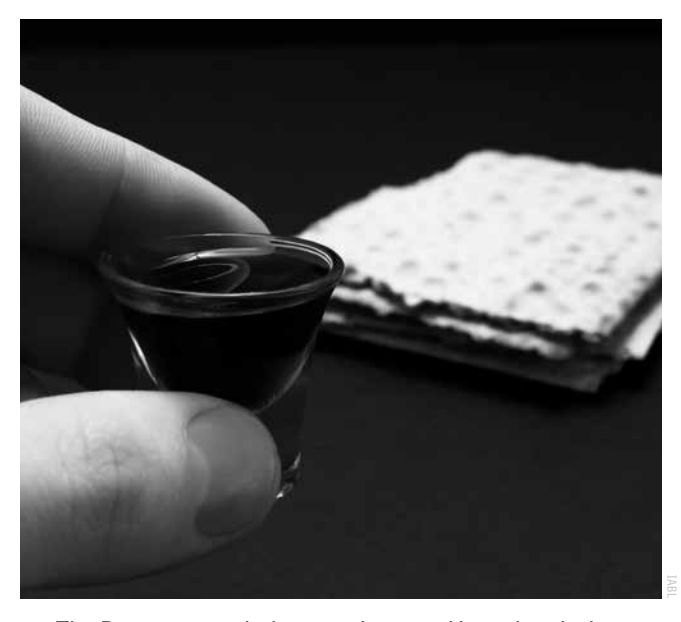
The Passover symbols are unleavened bread and wine.

The Apostle Peter records that Jesus Christ was the Lamb of God , without spot or blemish (1 Peter 1:18-20). The lamb that the ancient Israelites killed on Passover represented the Word, who would become human, live a sinless life, and die for the sins of all mankind!