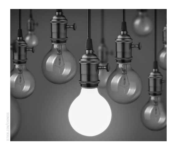
Like electricity is the power lighting a lightbulb, the Holy Spirit is the power of God.

Turn to 1 Corinthians 5:7 and fill in the blanks from the last half of the verse: "For even _____ our ___ is ____ for us."