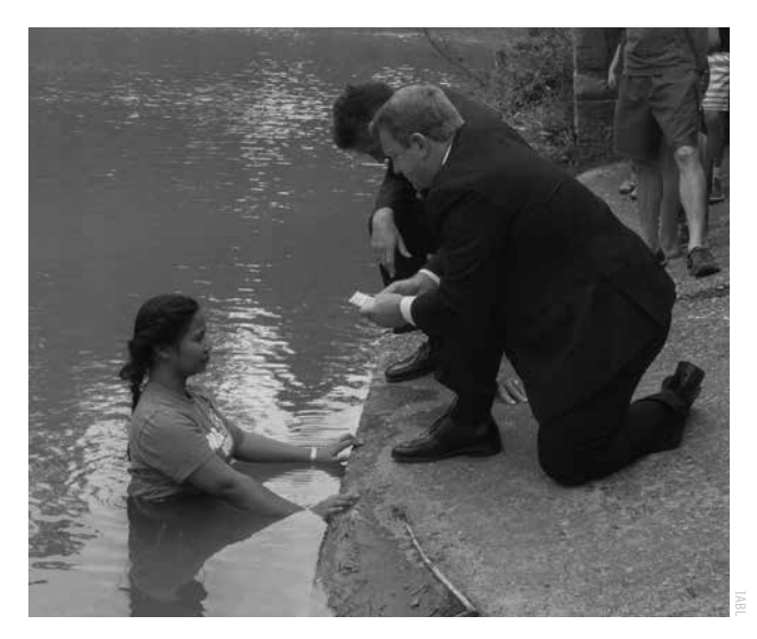
At baptism, God gives us a portion of His Holy Spirit.

Receiving God's Holy Spirit is what makes someone a member of God's Church. God gives His Spirit as a special gift to those adults who repent of their sins, are