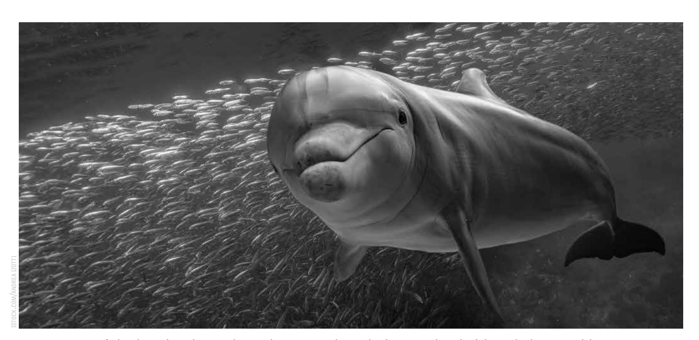
Animals can't understand art, science or mathematics because they don't have the human spirit.

Just as the human spirit enables a person to understand things that animals cannot understand,