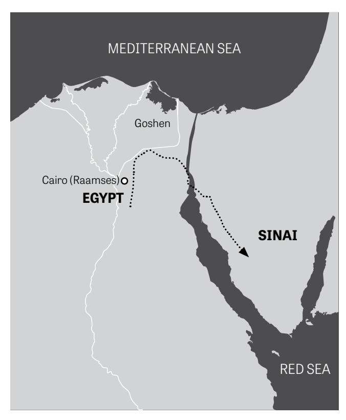
This map shows the path the Israelites took as they fled Egypt.

lamb was a type of the blood of Jesus Christ , the sinless Savior who would come 1,400 years later and die for the sins of mankind!