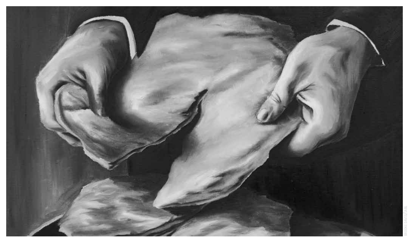
The unleavened bread used at the Passover ceremony symbolizes the broken body of Christ.

allowing them to come into the house. At first, the disciples could not understand why the Son of God was performing this menial task!