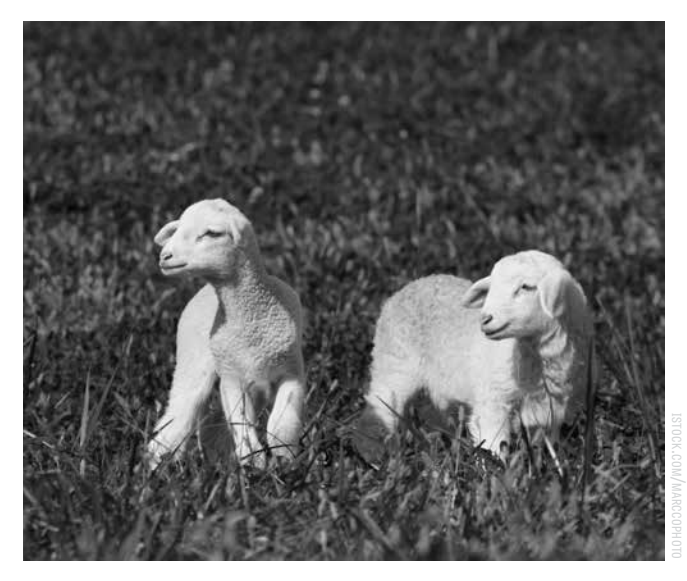
The Israelites slew a young lamb and smeared its blood on the doorposts of their houses.

But while the night lasted, they could not leave their houses. The reason was that on that night, the