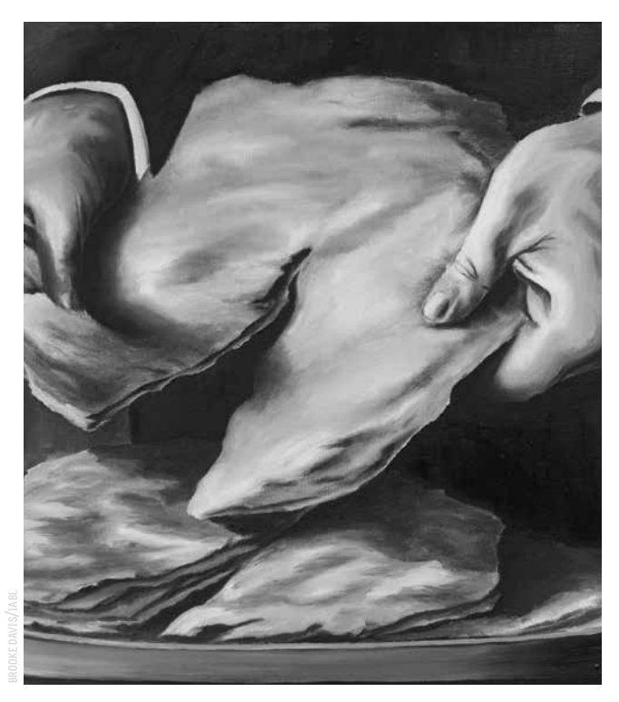
Unleavened bread is used at the Passover to symbolize the broken body of Christ.

_____ and smear it on the _____ of their houses. If the Israelites followed God's instructions, their _____ were spared from death. Deuteronomy 12:32 shows us that we should: _____