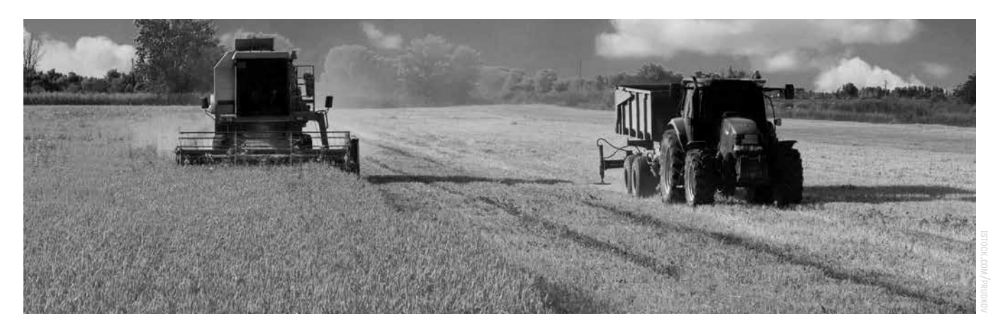
The grain harvest pictures the future spiritual harvest of human beings to be born into the God Family.