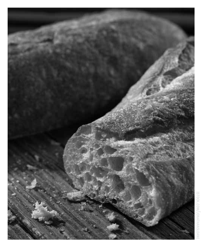
God's people remove leavened products from their homes, thus picturing the removal of sin from their lives.

God commands us to remove leavening from our houses before the first day of Unleavened Bread in order to remind us how important it is to put sin out of our lives. It is important to help your parents clean the house before the Days of Unleavened Bread. When you vacuum your room and search for crumbs under the seats of the car, you are obeying God's command and learning to diligently observe this symbol of laboring to get sin out.