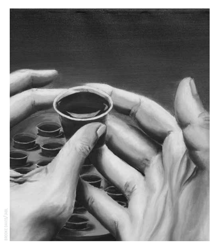
The wine at Passover is a symbol of Christ's shed blood.

But He never sinned. This means that He didn't die for His own sins—He died for