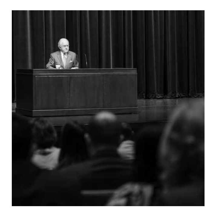
God's Church today keeps God's sacred festivals and understands their beautiful meaning.

put the pieces together and understand the mystery of why you exist!