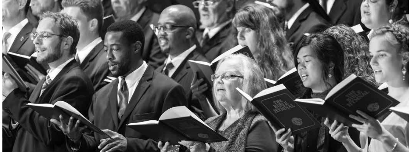
We praise God by singing hymns during His annual festivals.