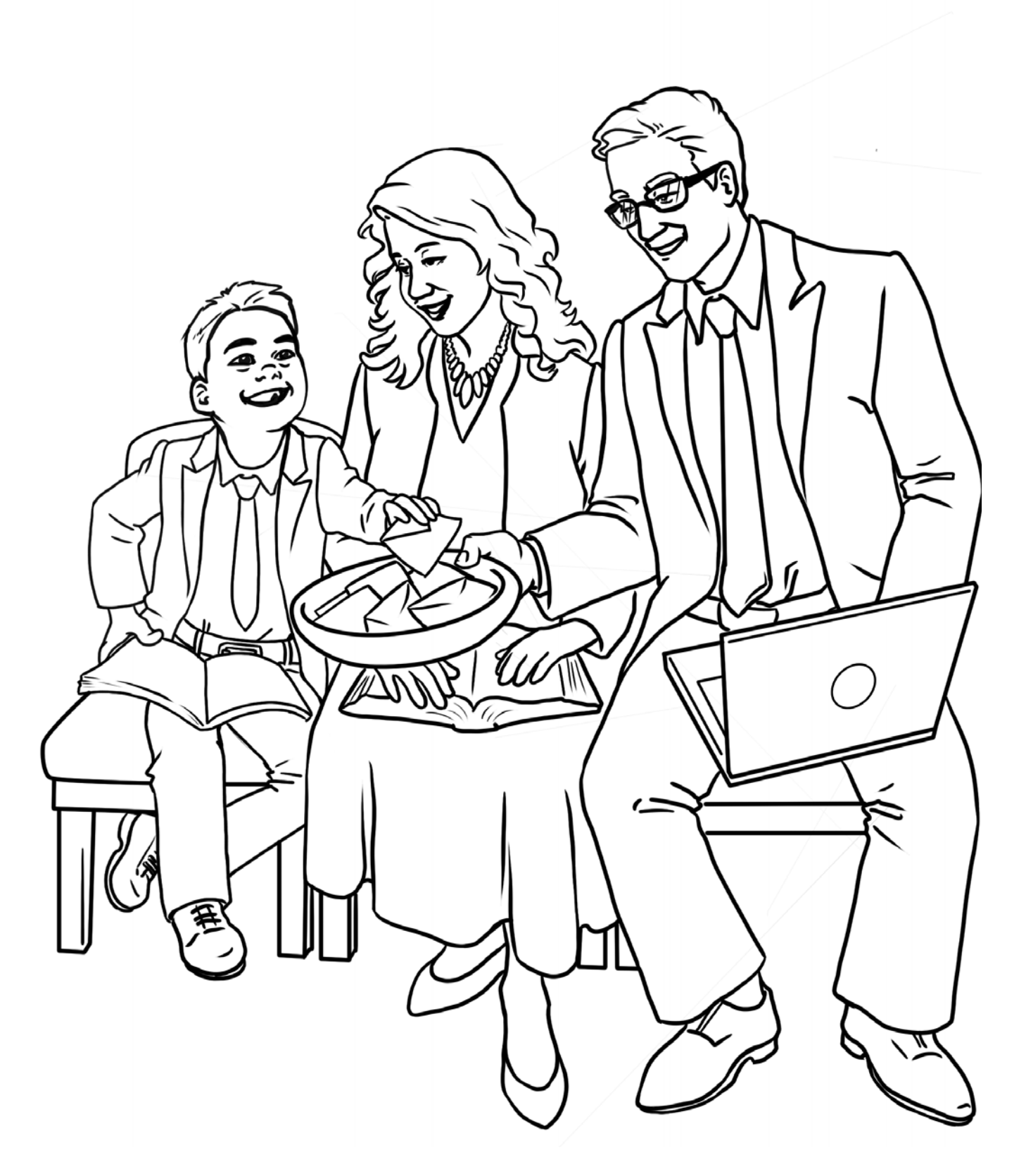
The day of Pentecost focuses on the first people God is calling into His Family: people in His Church.