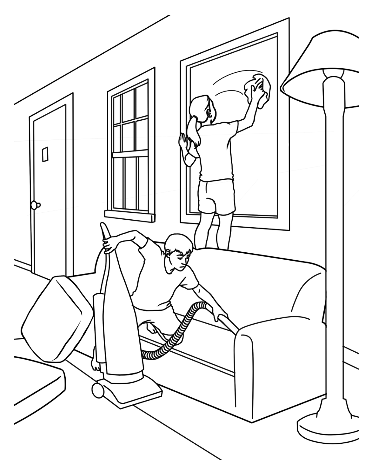
Before the Days of Unleavened Bread begin, people in God's Church clean all leaven out of their homes, including crackers, cookies and crumbs.