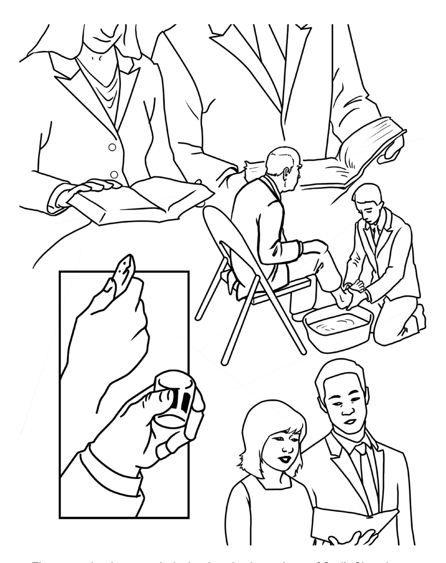
These are the three symbols that baptized members of God's Church use on Passover to remember the life and death of Jesus Christ.