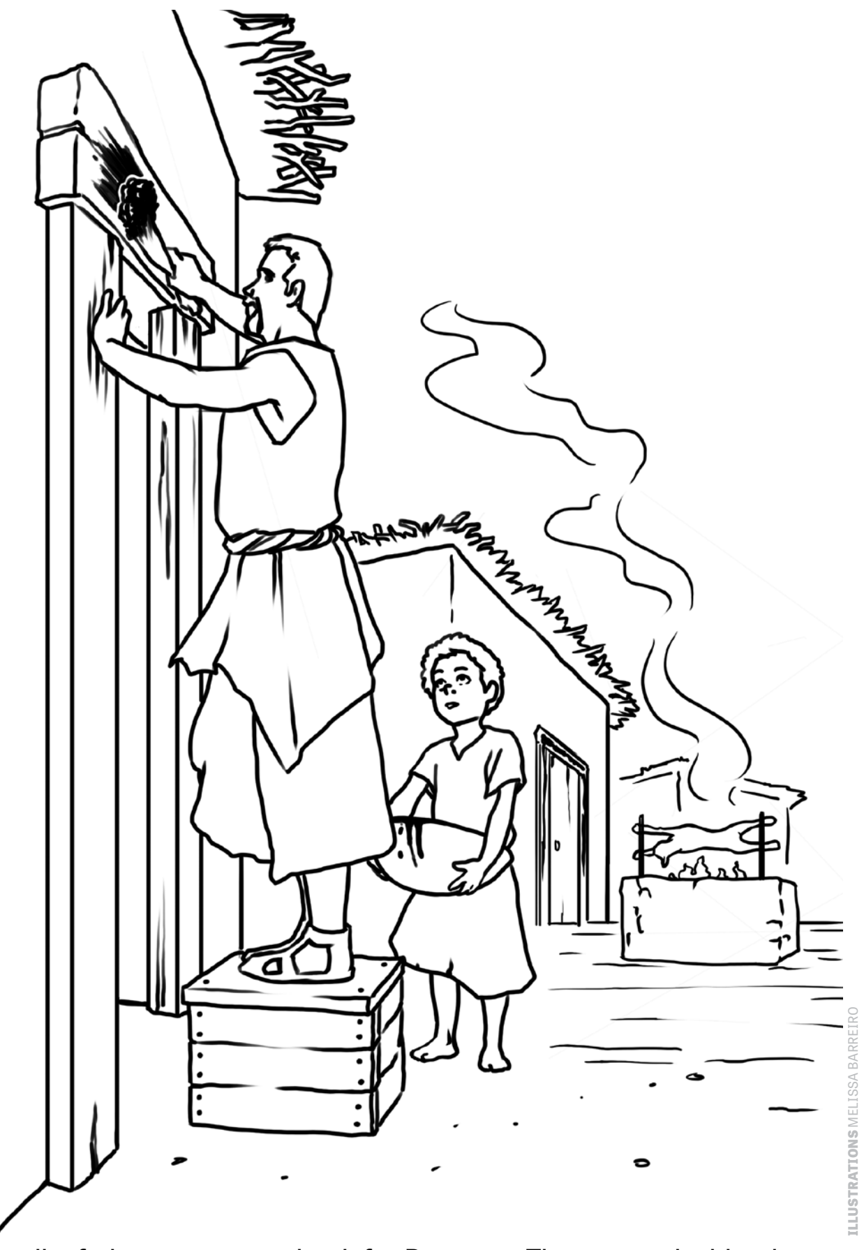
Israelite fathers prepare a lamb for Passover. They smear its blood on their doorposts so the death angel will pass over their homes.