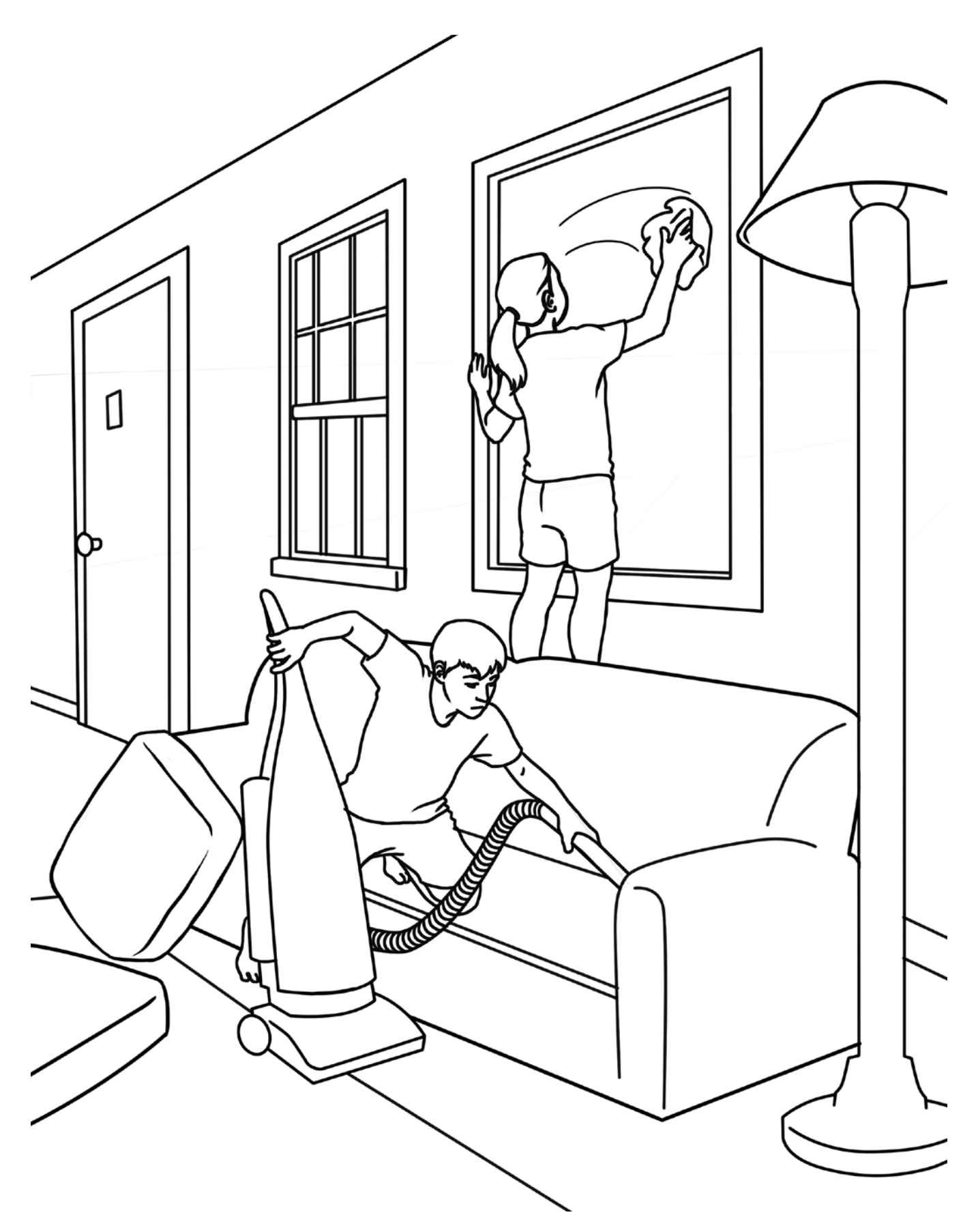
We clean all leavening out of our homes before the Days of Unleavened Bread begin.