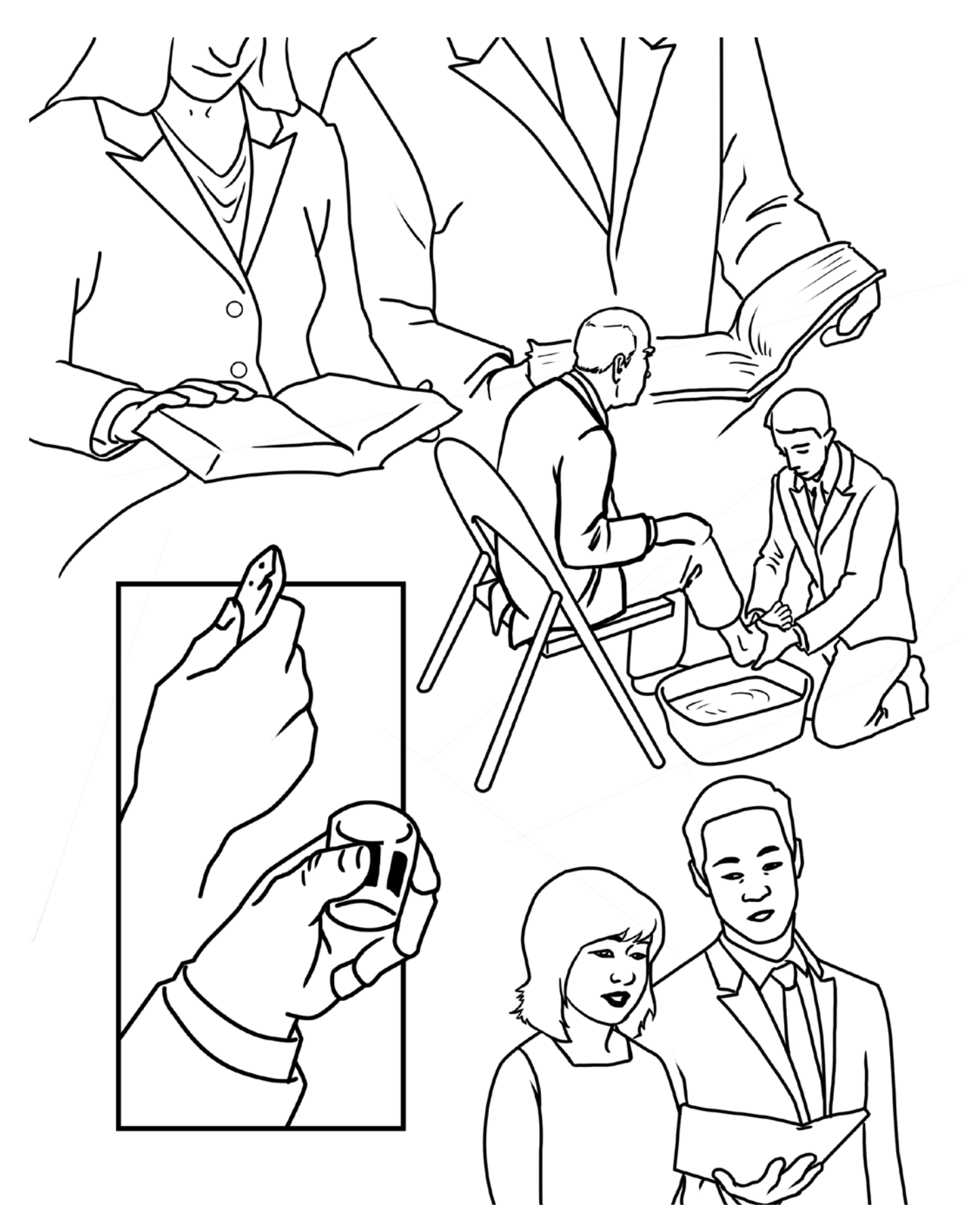
These are the three things baptized members of God's Church do on Passover to remember Jesus Christ's death.