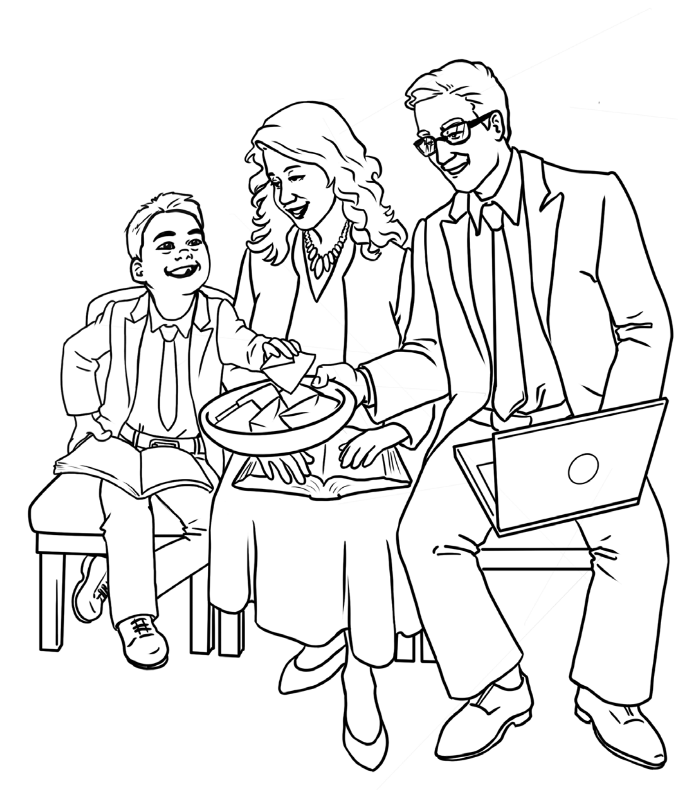
The day of Pentecost is about God's people in His Church, the first ones He is calling into His Family.