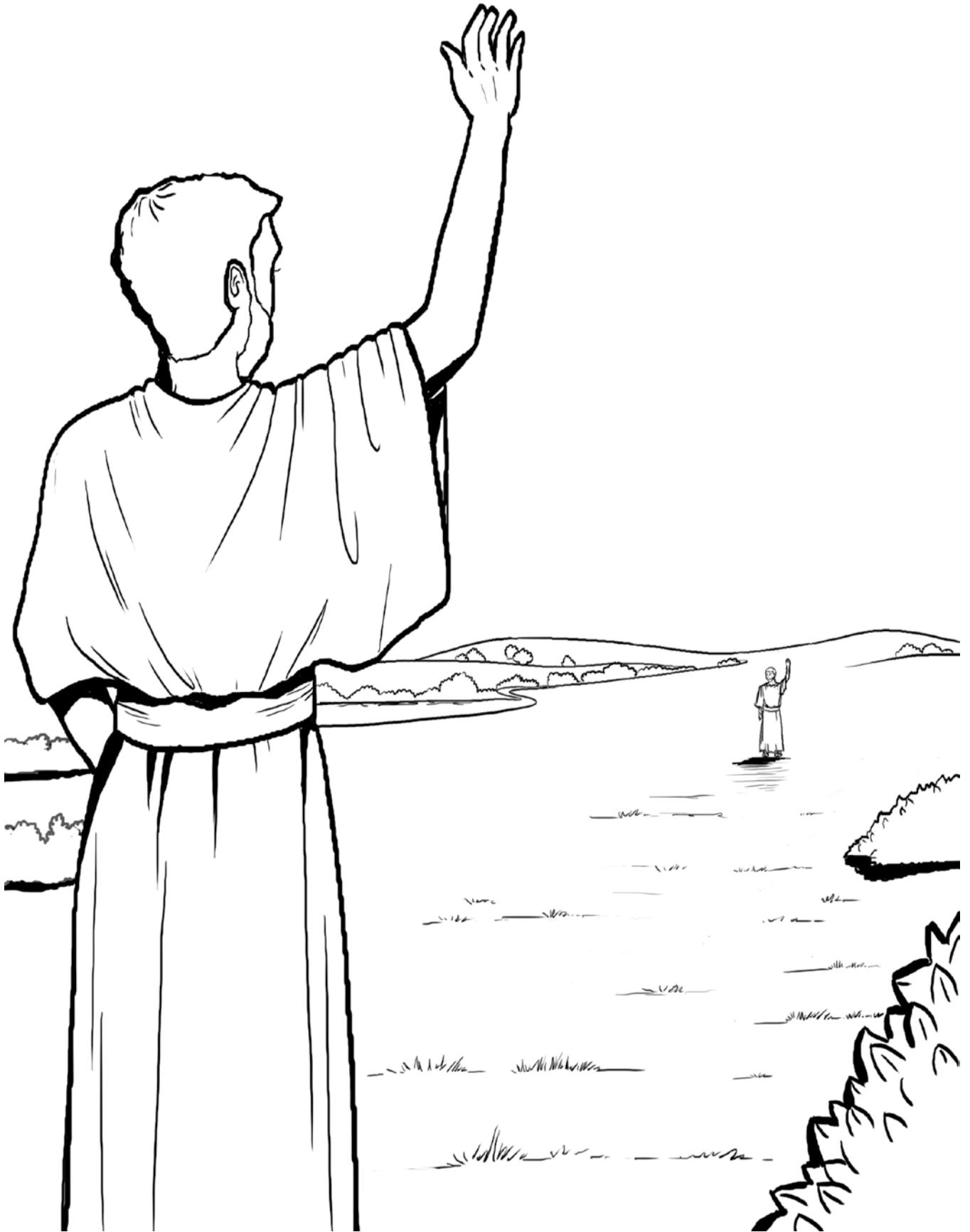
Abram and Lot part ways.