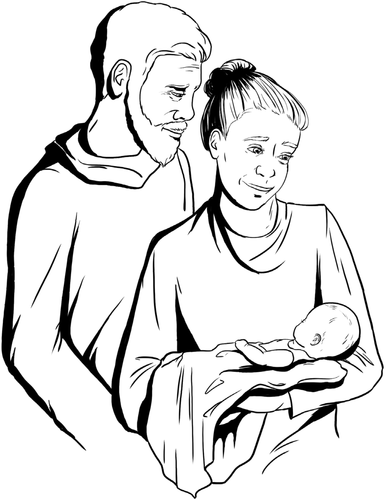
Abaraham, Sarah and Isaac