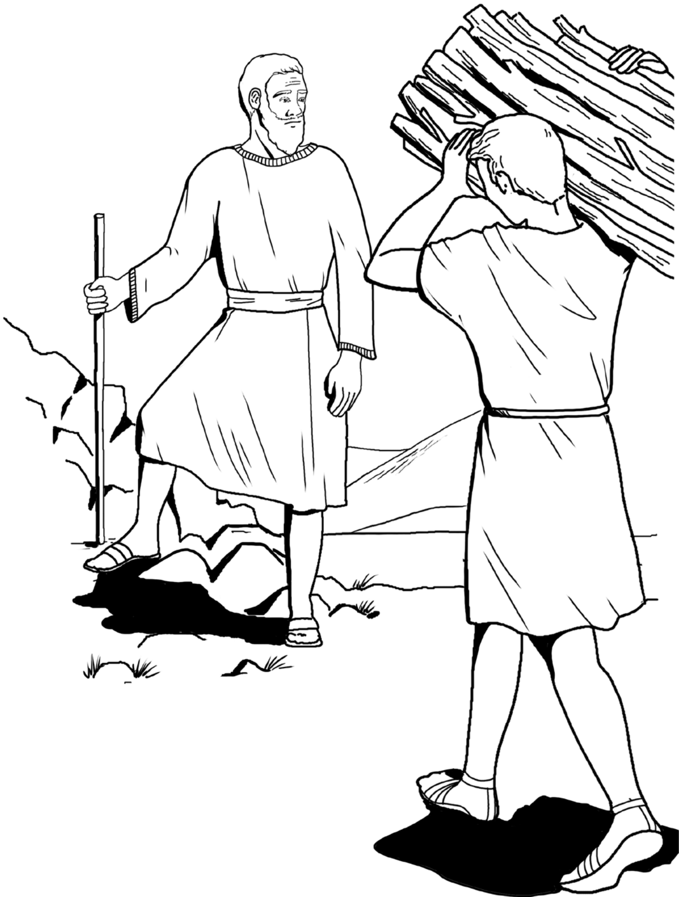
Abraham and Isaac climb up the mountain.