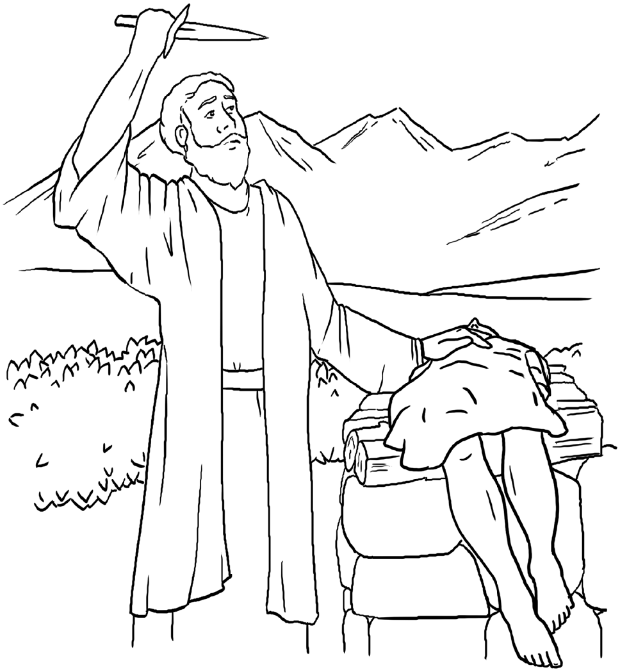
Abraham prepares to sacrifice Isaac.